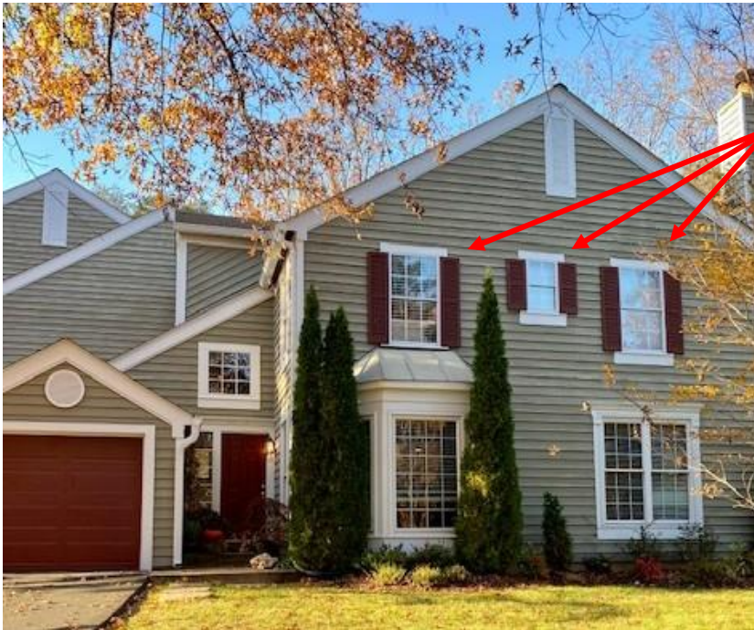
Shutters on the 3 upper windows on the Juniper end unit.